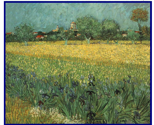
View of Arles with Irises, 1888, Van Gogh Museum, 21X25", oil on canvas