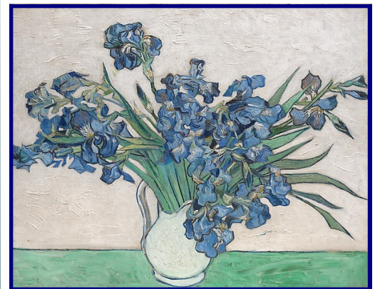
Irises, 1890, The Metropolitan Museum of Art, 20X36", oil on canvas