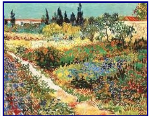
Garden with Flowers, 1888, Gemeentemuseum den Haag, The Hague, Netherlands, 28X36", oil on canvas